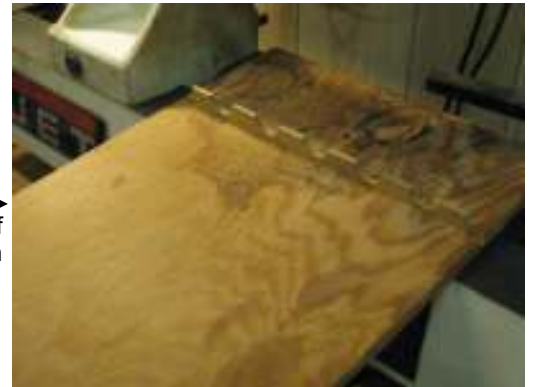
Here, you see the shelf top without anything on it. You will notice the notches to keep the turning tools from falling off.