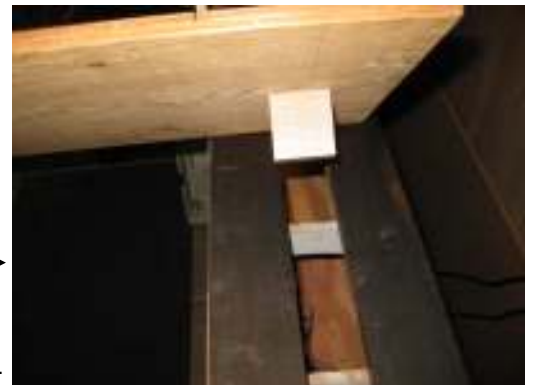
This photo shows the bottom of the shelf with the hard maple block in relation to the bed of the lathe.