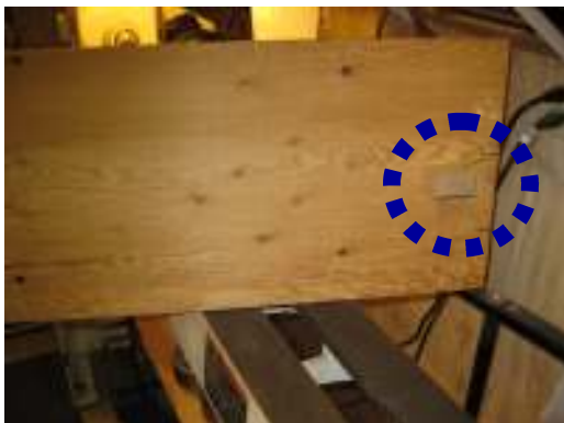
The bottom of the shelf with a piece of Hard Maple attached which keeps the shelf with all its contents from falling off the lathe.