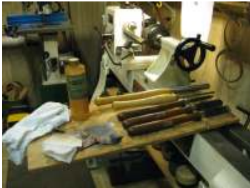
The shelf in use with typical stuff I usually work with.