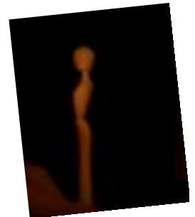
We saw her there, lurking in the shadows, but nobody remembers who she is.