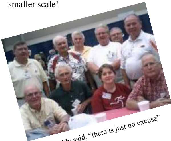
My daddy said, "there is just no excuse"

During the convention, there were some wow moments of "Why didn't I think of that!", but that will be for my next installment. Overall I had a great time getting to know my fellow COWA members and watching them spend money. To my beginners, I hope you will also have a chance to one day go to SWAT. It is a great gathering of minds, ideas, tricks and tips. Something our club meetings also provide but in a slightly smaller scale!