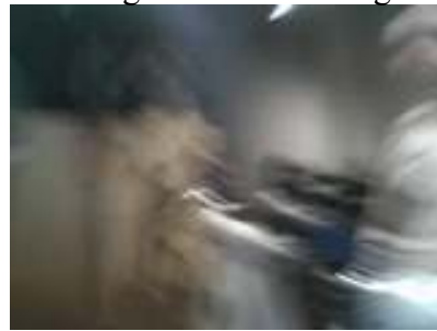
Will the turning EVER STOP???