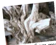
A little something from my trunk...